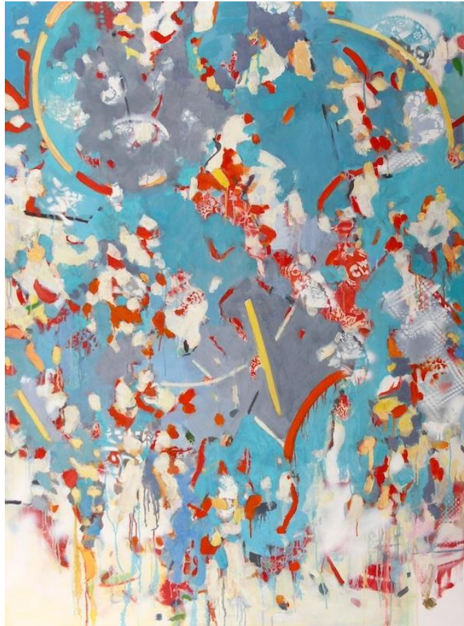
Gina Werfel, Calico , 2024 Oil and mixed media on canvas, 48 x 40 inches