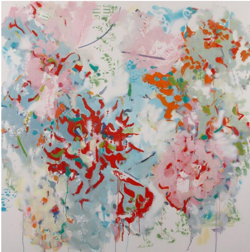
Gina Werfel, Entangled , 2024 Oil and spray paint on canvas, 48 x 48 inches

With studios in both California and New York, Gina Werfel links Asian influences, including landscape and calligraphy, to Western traditions, especially Baroque figure painting, integrating them both within an overall practice of lyrical mark-making.