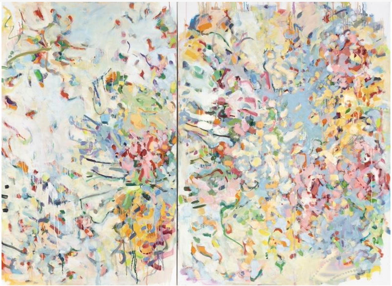
Gina Werfel, Trellis , 2023 Oil on canvas, 46 x 66 inches, diptych