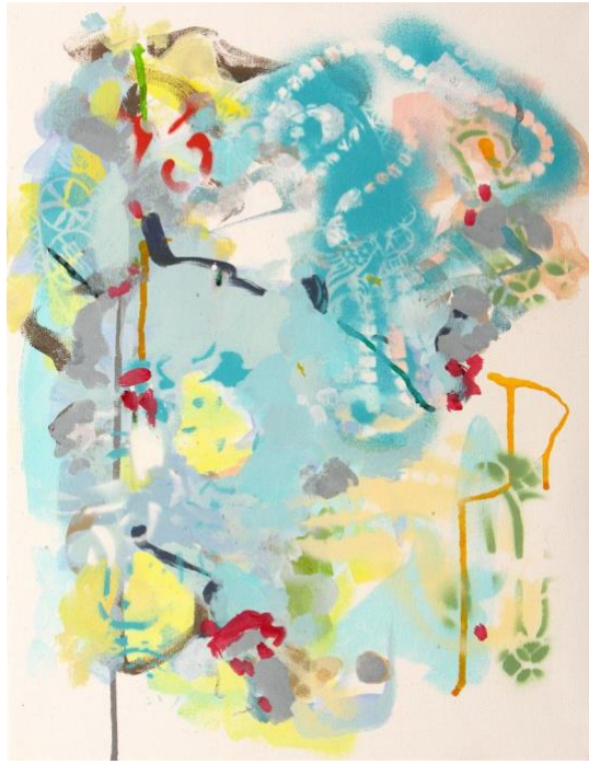
Gina Werfel, Pearls , 2024 Acrylic and mixed media 18 x 24 inches